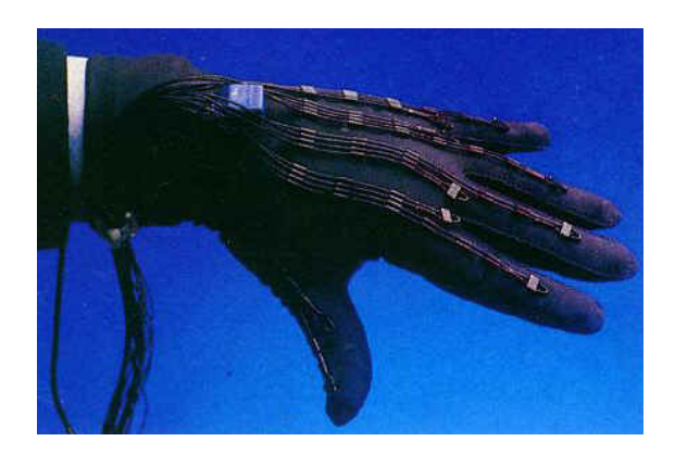
Figure 2: Data Glove

The Data-Glove is the device that most people think of when talking about VR input devices. It is the device that allows us to do everything in the virtual world that our real hand can do in the real world. The data glove is the translator from real to virtual. But there are too many degrees of freedom and too many possible device configurations, that the user simply has to come to the point where he fails