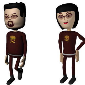
Figure 6: The Villains

Healthy eating messages had to be incorporated subtly, so as not to distract from the main gameplay. The first, simple idea is to place short and relevant text tips onto the loading screen. The second idea, actually, defined the story of the game. As a young sorcerer, the player is required to deliver food packages to the famine struck islanders, while two villain characters (Figure 6), for nefarious reasons, are slipping in unhealthy food in an attempt to make islanders overweight. The player needs to eliminate these unwanted packages. Two pedagogical issues had to be taken into account. Firstly, the main character cannot be modified to look overweight. Secondly, the player is not allowed to fight the villains directly.