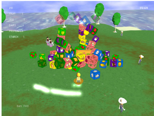
Figure 7: An Island Level

senting the gameplay on one of the islands is shown in Figure 7.