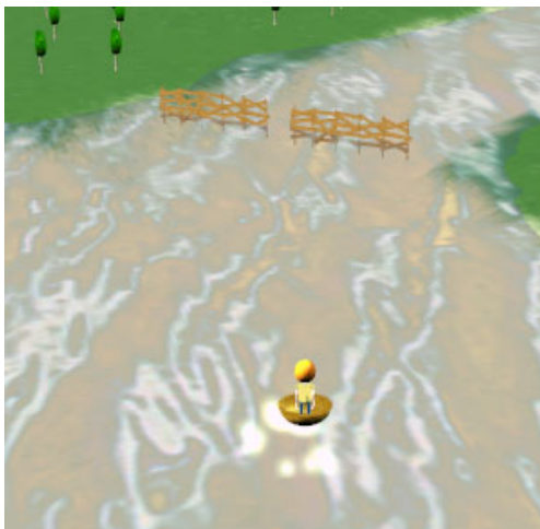
Figure 4: A Dam Blocking the Exit

The primary vehicle for moving the character is a coracle. This means of transport fits well into the lake environment and interfaces smoothly with Wii Balance Board and Wii Controller. The controller is used for rowing action which propels the coracle forward, while direction is altered by leaning left and right on the Wii Board. This routine, which increases physical activity, has also been used in its own right for a mini-game when the player travels between lakes. To go from one lake to another a player is required to sail down the river full of obstacles (stones, logs, whirlpools) and try to collect bonuses which can later be used on the islands, or increase score (Figure 5).