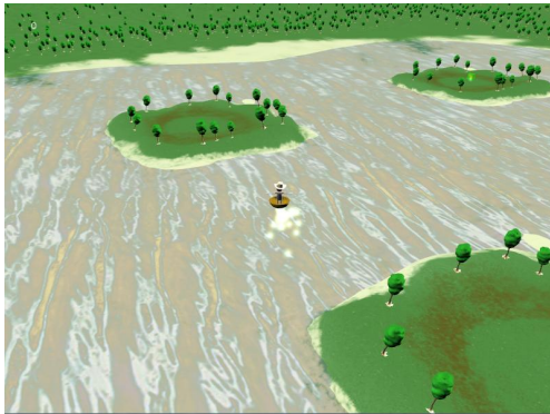
Figure 3: One of the Lakes

overcome this problem and balance challenge and control, the decision was made to have a number of lakes, each containing multiple islands (Figure 3). An island could be freely chosen but transition to the next lake would be locked (Figure 4) until completion of all the levels or scoring a certain number of points. The lakes could have different art themes (e.g. winter, desert, and volcano). In this setting, assets could be reused requiring only slight changes (e.g. textures). This would reduce development time while preserving variety.