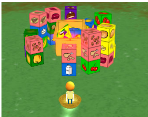
Figure 8: Blocks Used in a Level

In general, packages are separated into six categories according to food group division (e.g. dairy products, fruit, and vegetables) with one category being unhealthy food (Figure 8). Packages of each group are colour coded, reducing confusion. One of five food group members is represented on a package (e.g. fruit package would be green and could have cherries depicted on it) giving the total of 30 distinct packages.