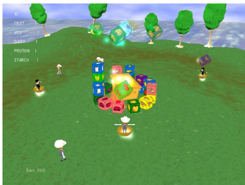
Figure 1: The Game's Art Style

The targeted age group governed the choice of the art style, shown in Figure 1, which can be described as cartoony. Characters, environment and even animation are exaggerated with a simple yet vivid colour scheme full of contrast. All edges are accentuated by hard black lines. This style is not only appealing to children but it also accelerates development by reducing time required for modelling, texturing and animation, as less precision and realism is needed. In addition, it should help keep children's concentration as no distraction is created by unnecessary details.